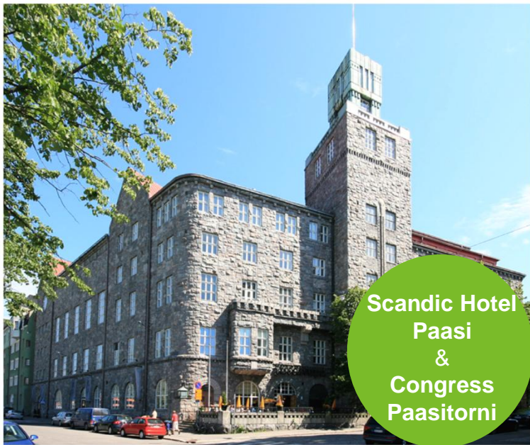
Scandic Hotel Paasi & Congress Paasitorni